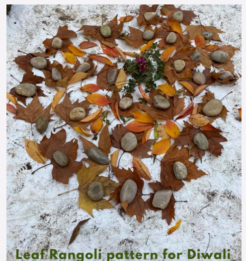
Leaf Rangoli pattern for Diwali